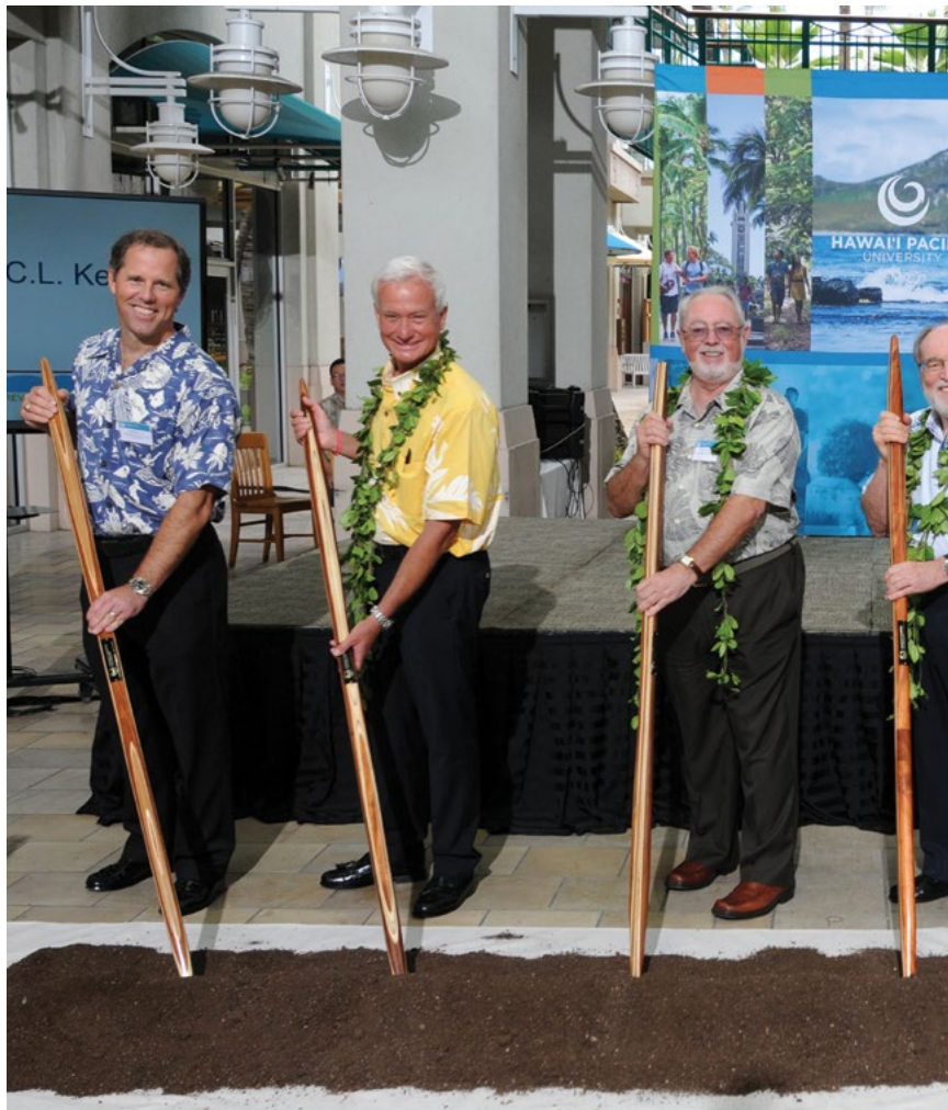
Photo: The Aloha Tower Marketplace Ceremonial Groundbreaking (June 18, 2014)

"We must continue to raise the bar on higher education quality so that Hawai'i students who want to stay have additional choices from which they can choose,"